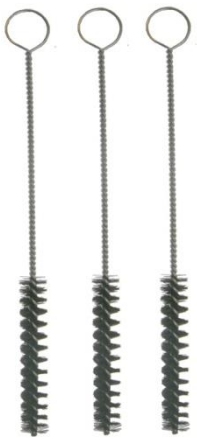
Spile Cleaning Brush Cleaning brushes used to clean spiles before tapping trees and at the end of the season.