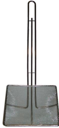
Skimmer Ladle Skimmer used when boiling maple syrup to remove foam layer.