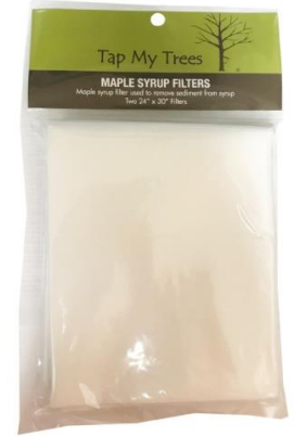
Maple Syrup Filters Package of two 24" X 30" filter sheets to filter sediment from finished syrup. Dura pure grade filter.