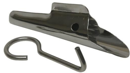
Metal Spile/Hook Stainless steel spile to be used with 7/16" tap hole.