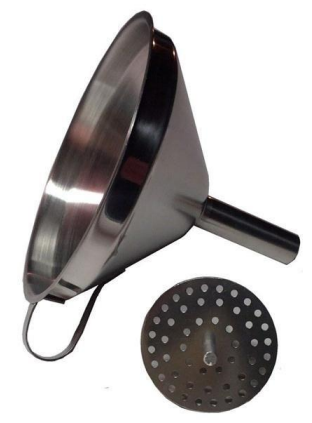
5" Stainless Funnel Food grade stainless steel funnel.