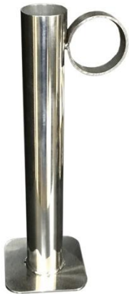
Hydrometer Test Cup Stainless steel hydrometer test cup used with maple syrup hydrometer to test sugar content of maple syrup. Test cup height is 8 inches and diameter is 1 inch.