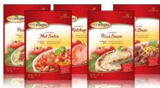
Tomato & Salsa Mixes