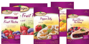
Fruit Mixes, Preserves, & Pectin